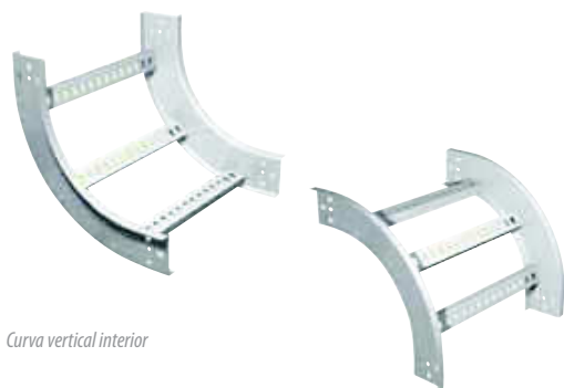
Curva vertical interior