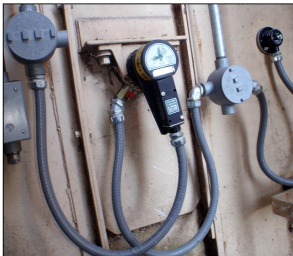
Whirligig on Bucket Elevator with M800 Elite Speed Switch

Please refer to instruction manual for correct installation. Information subject to change or correction. Jul 2018