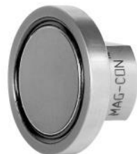
Mag-Con™ (MAG2000) U.S. Pat #6,964,209