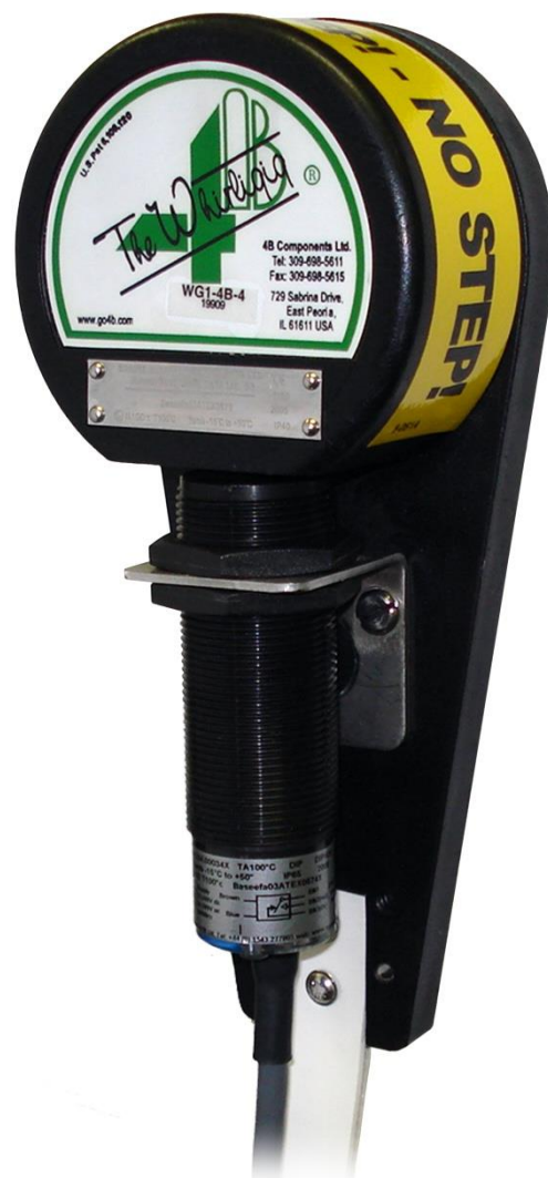
Whirligig Shown with M300 Slips switch (Sensors Sold Separately)