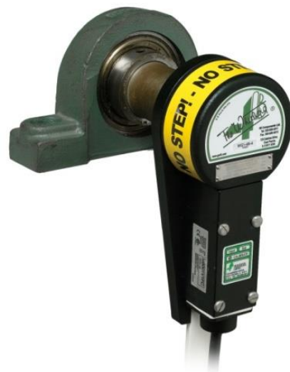
Whirligig Shown with M800 Elite Speed Switch (Sensor Sold Separately)